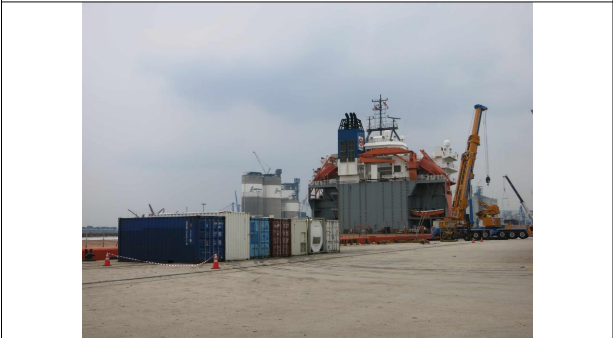
Pic 2: View of SOC containers staging at shipside and mobile crane set-up in progress

This unique vessel is semi-submersible, with deck-load 25 ton/M2. Vessel LOA at 146.30 meter and breadth at 36.00 meter.