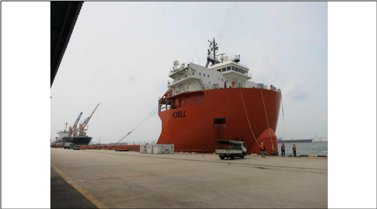
Pic 1: Heavy Marine Transporter, MV Fjell is berthing in Jurong Port Singapore to receive Cable winch & equipment prior set off for offshore installation work.

This unique vessel is semi-submersible, with deck-load 25 ton/M2. Vessel LOA at 146.30 meter and breadth at 36.00 meter.