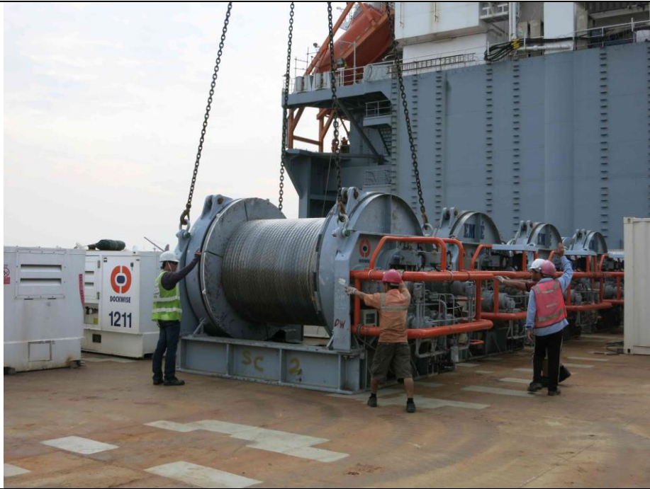
Pic 3: Loading in progress for 40 ton winches