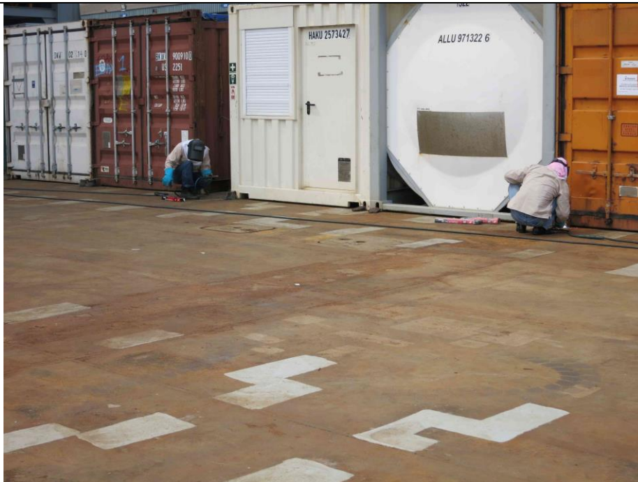
Pic 5: Sea-fastening in progress